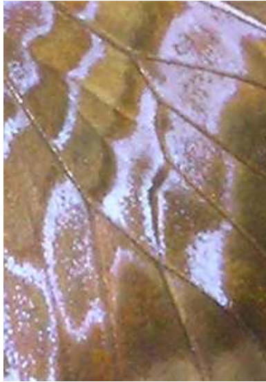
Lilac Fork - Lethe sura Doubleday