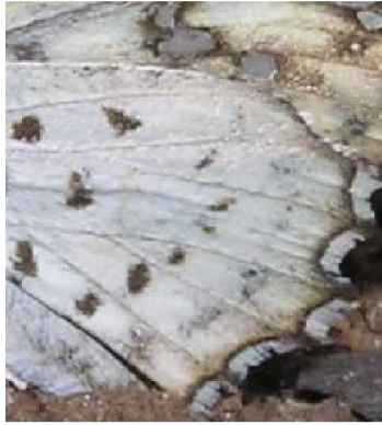
Golden Angle - Caprona (ransonnetti) potiphera Hewitson