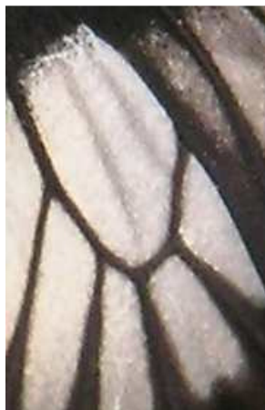
Malabar Rose - Pachliopta pandiyana Moore