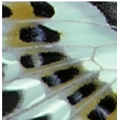
Malabar Banded Swallowtail - Papilio liomedon Moore