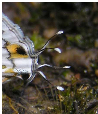
Orchid Tit - Chliaria othona Hewitson