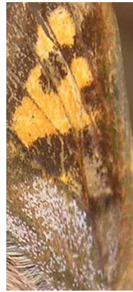
Hewitson's Silverline - Spindasis ictis Hewitson