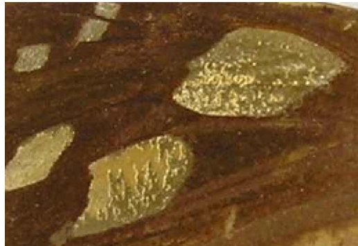
Giant Red Eye - Gangara thyrsis Fabricius