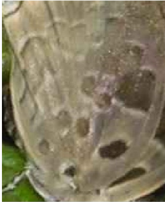
Blue-Bordered Plane - Bindahara moorei Frühstorfer