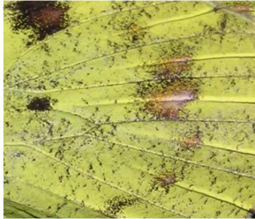
Yellow Orange Tip - Ixias (pyrene) sesia Fabricius