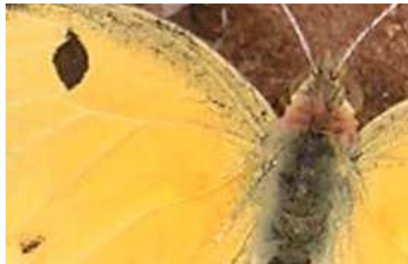
Large Salmon Arab - Colotis (fausta) fulvia Wallace