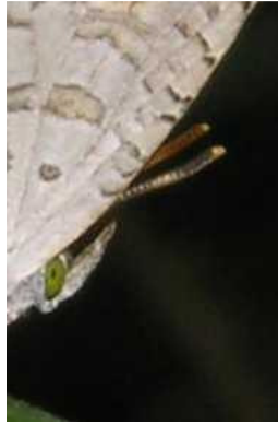
Apefly - Spalgis epius Westwood