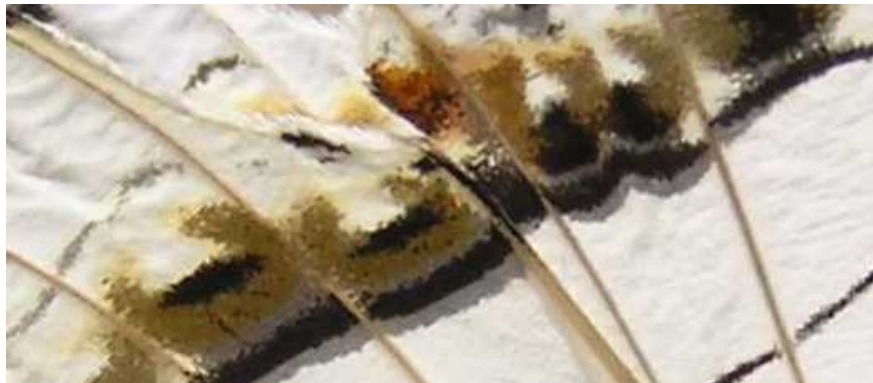
Streaked Map - Cyrestis (thyodamas) indica Evans