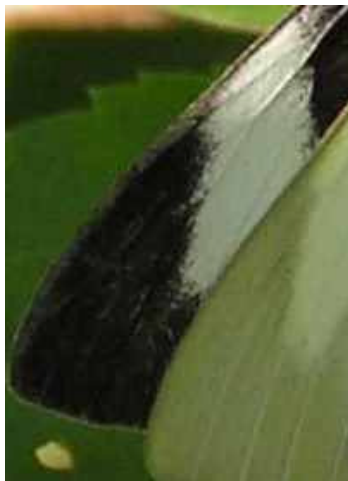
Striped Albatross - Appias libythea Fabricius