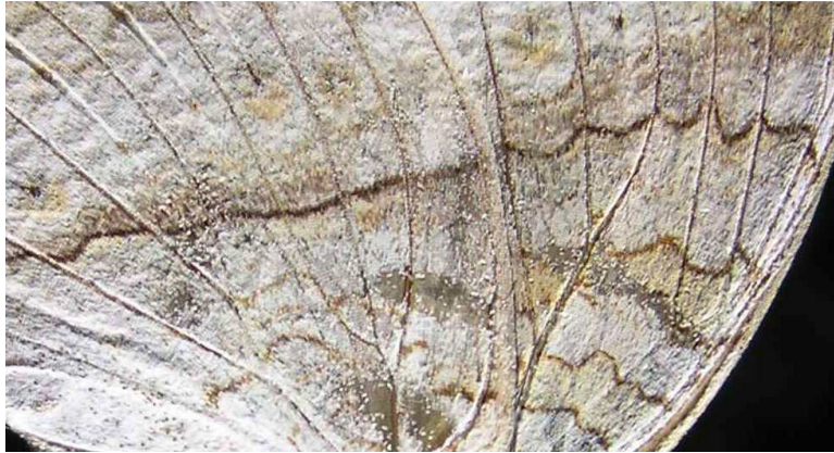
Grey Pansy - Junonia atlites Linnaeus